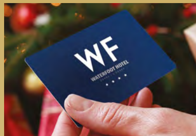
GIFT CARD Monetary Value of Choice