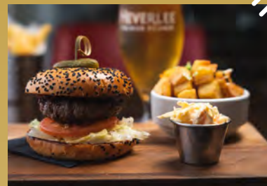
LUNCH/DINNER IN THE WINEBAR Monetary Value of Choice