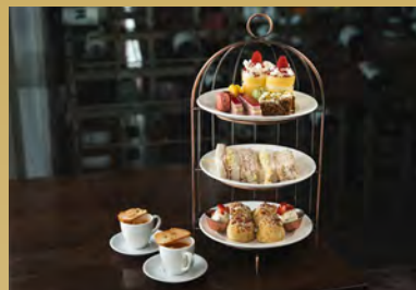
AFTERNOON TEA FOR TWO £45.90