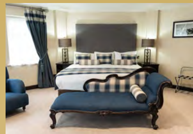
OVERNIGHT STAY WITH DINNER PACKAGE From £109