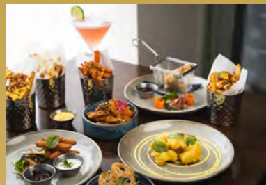
BOTTOMLESS BRUNCH FOR TWO £59.90